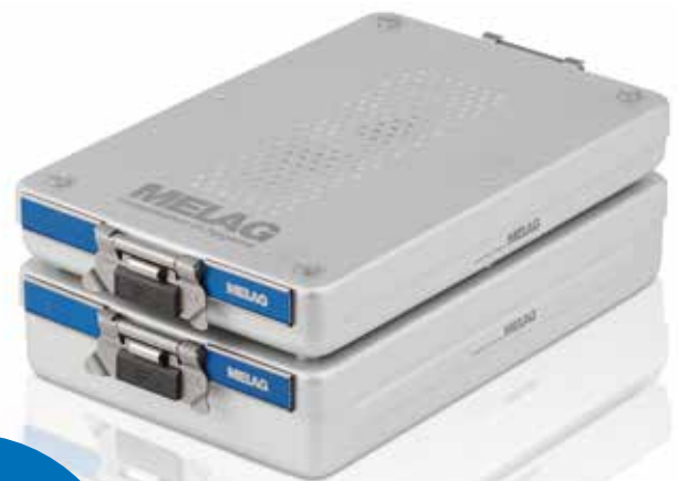
MELAstore – Boxes