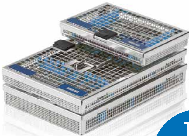
MELAstore – Trays

Safe instrument storage in the MELAstore system raises the level of protection afforded to the practice team and the instruments themselves.