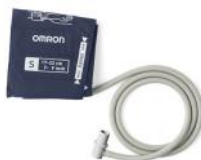
SMALL CUFF 17-22cm HXA-GCFS-PBE (with 1 m tube) HXA-GCFS-PCE (with 4.5 m tube)