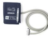
XSMALL CUFF 12-18cm HXA-GCFXS-PBE (with 1 m tube) HXA-GCFXS-PCE (with 4.5 m tube)