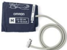
MEDIUM CUFF 22-32cm HXA-GCFM-PBE (with 1 m tube) HXA-GCFM-PCE (with 4.5 m tube)