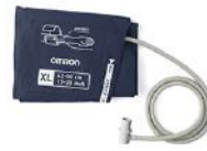
XLARGE CUFF 42-50cm HXA-GCFXL-PBE (with 1 m tube) HXA-GCFXL-PCE (with 4.5 m tube)