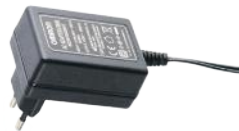
AC ADAPTER-E1600 AC ADAPTER-UK1600