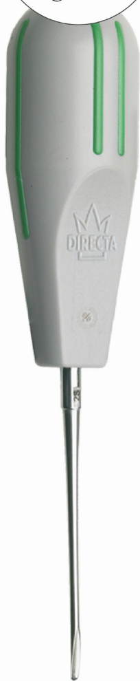
L2S Periotome 2 mm Straight Standard