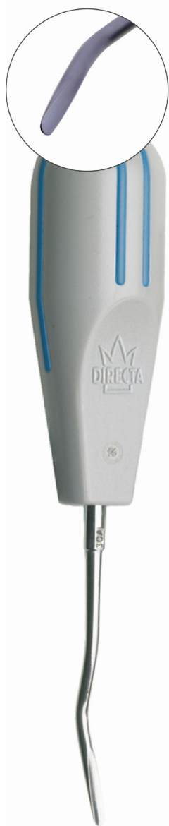
L3CA Periotome 3 mm Contra Standard