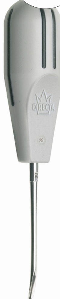
L3C Periotome 3 mm Curved Standard