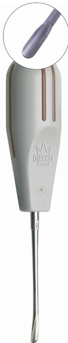
L5C Periotome 5 mm Curved Standard