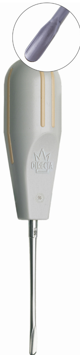
L5S Periotome 5 mm Straight Standard