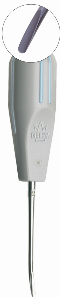
L3IC Periotome 3 mm Inverted Standard