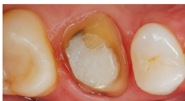
Dentistry and photography courtesy of Robert Lowe, DDS

The carboxylate resin in Cling2 is bacteriostatic, reducing gingival plaque retention and sulcus inflammation to maintain tissue health.