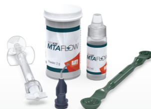
3980-1 MTAFlow Kit (8 to 10 applications per kit)